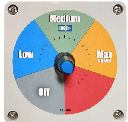
EC-20K Manual Speed Control

Voltage change switch has removable rubber cover. (Switch factory set for 230V.)