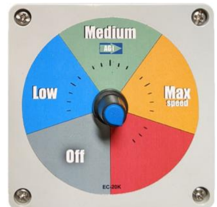
EC-20K Manual Speed Control

Voltage change switch has removeable rubber cover. (Switch factory set for 230V.)