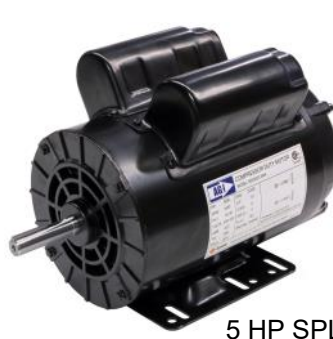
5 HP SPL

“DROP-IN” OEM REPLACEMENT FOR COMMON 3450 RPM “PORTABLE” AIR COMPRESSORS