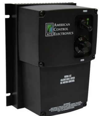
PAT410-10 NEMA 4X PLASTIC

INFORMATION ON THIS PAGE IS FOR GENERAL REFERENCE ONLY ON ACE CONTROL. CONTACT AG-I MOTORTEC FOR INFORMATION, PRICING AND DELIVERY ON THE WHOLE RANGE OF ACE PRODUCTS.