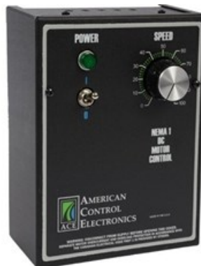
LGC410-10 NEMA 1 STEEL