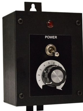
ELC110-5 VALUE DRIVE