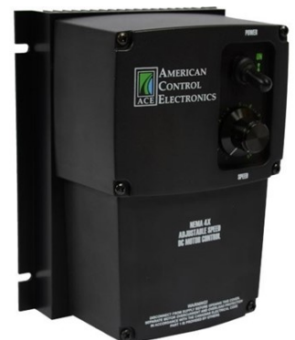
PAT410-10 NEMA 4X PLASTIC

INFORMATION ON THIS PAGE IS FOR GENERAL REFERENCE ONLY ON ACE CONTROL. CONTACT AG-I MOTORTEC FOR INFORMATION, PRICING AND DELIVERY ON THE WHOLE RANGE OF ACE PRODUCTS.