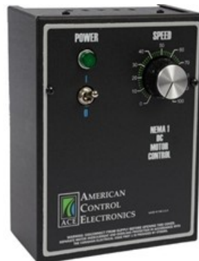
LGC410-10 NEMA 1 STEEL